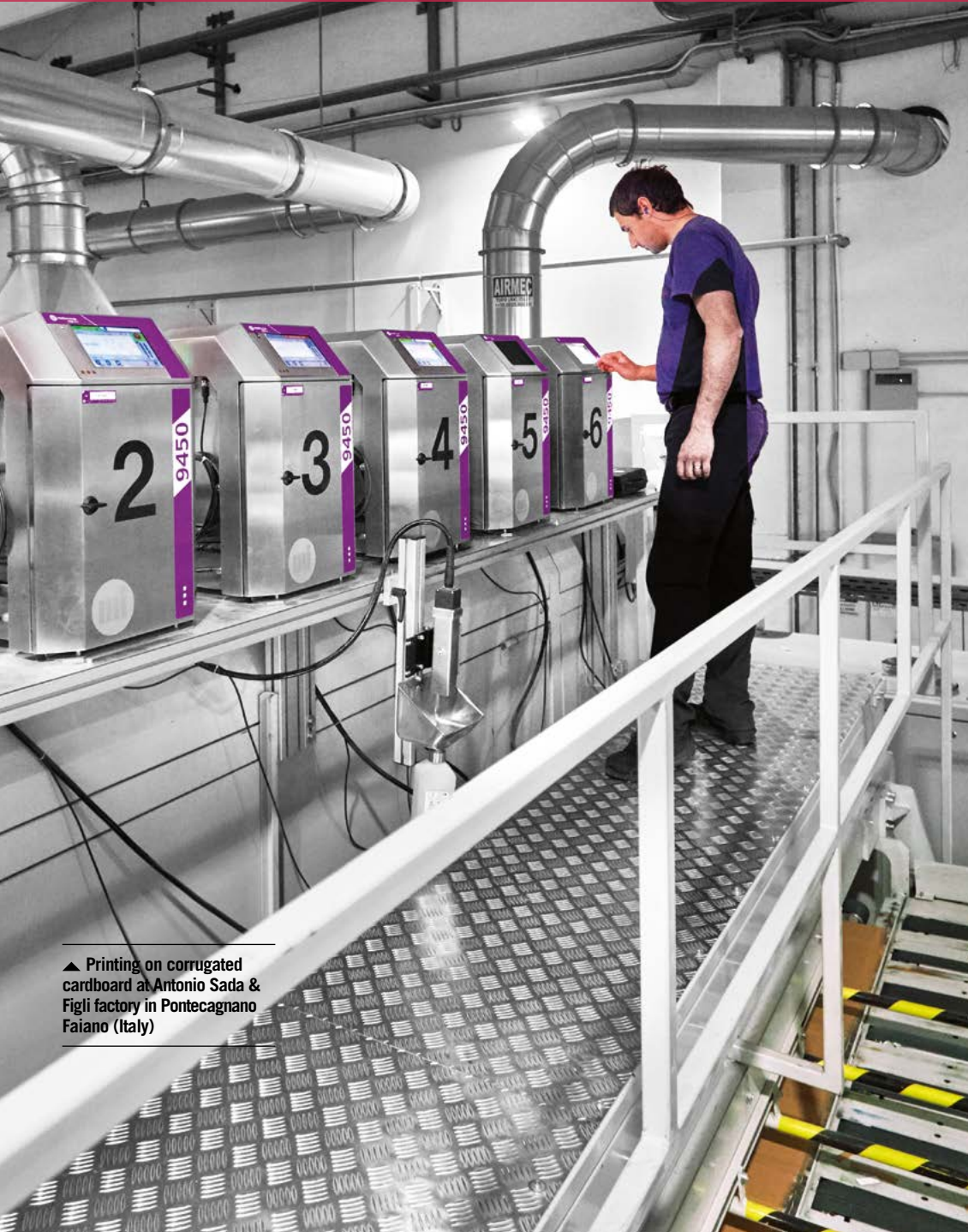
▲ Printing on corrugated cardboard at Antonio Sada & Figli factory in Pontecagnano Faiano (Italy)